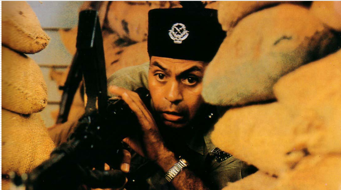
THE TRAGIC PATRIOT