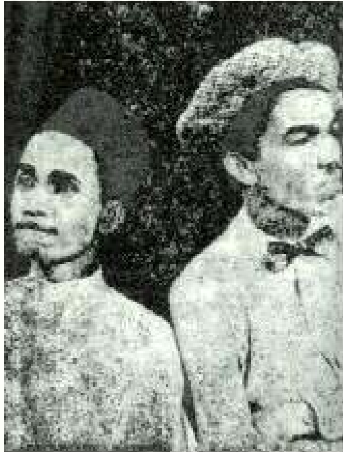
THE BANGSAWAN AND MIDDLE EAST INFLUENCE